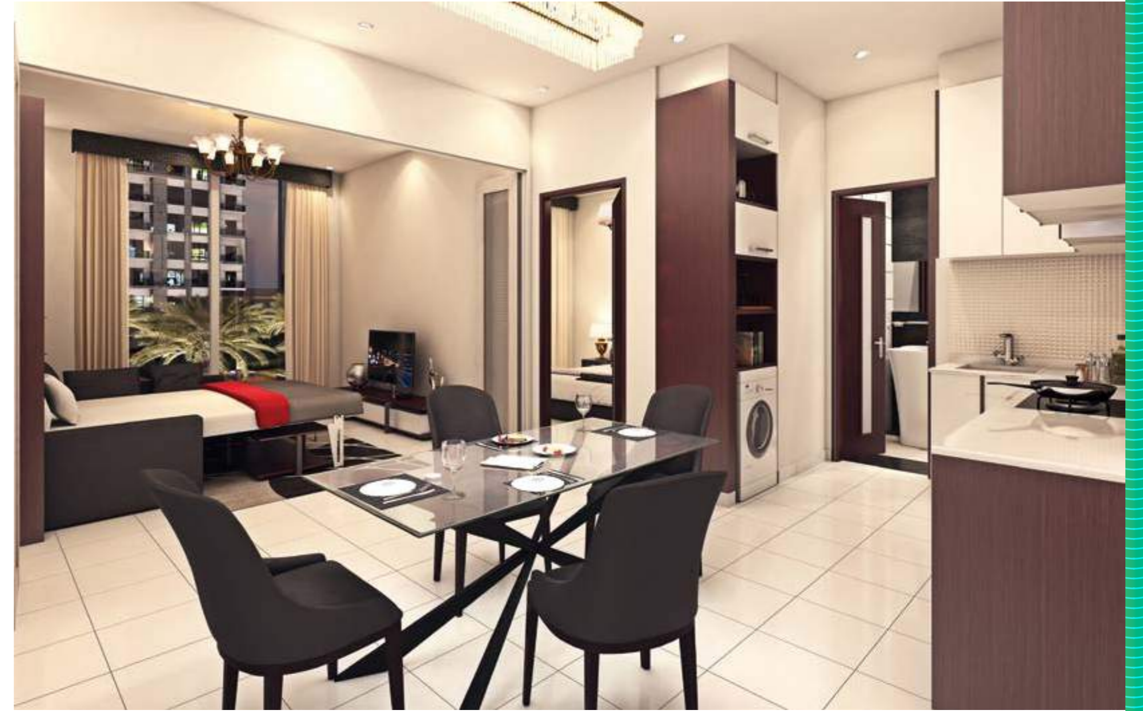
BEDROOM BY NIGHT

*Disclaimer: Please note that the apartments are unfurnished and furnishing will entail an extra cost.